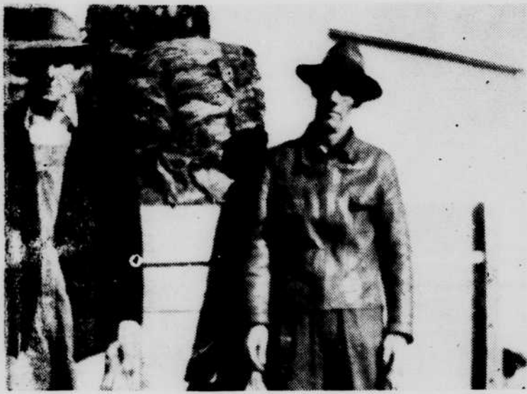
Caught by the roving cameraman are two Grayson county farmers with their tobacco at the Tri-State Warehouse. By bringing this picture to The Skyland Post and identifying themselves, they will receive a pleasant surprise.