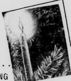
Candles . . . BLESSING

Hung on doors and windows, it invites celebrants in to share the Yuletide spirit. Ancient Romans decorated their homes with holly during religious festivals.