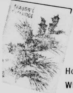
Holly . . . WELCOME

There may be a "hidden wish" in your Christmas cards this year. Many familiar designs have special meanings that are centuries old.