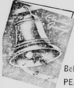
Bells . . . PEACE

Candles are burned in church as a symbol of enlightenment. It's an old Irish custom to place a lighted candle in the window on Christmas Eve, to guide the Christ Child on his long journey from heaven.