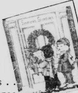
Carolers . . . HAPPINESS

An ancient legend says that when Christ was born, the devil died and all the earth's bells rang in celebration, just as they ring today on Christmas Morn.