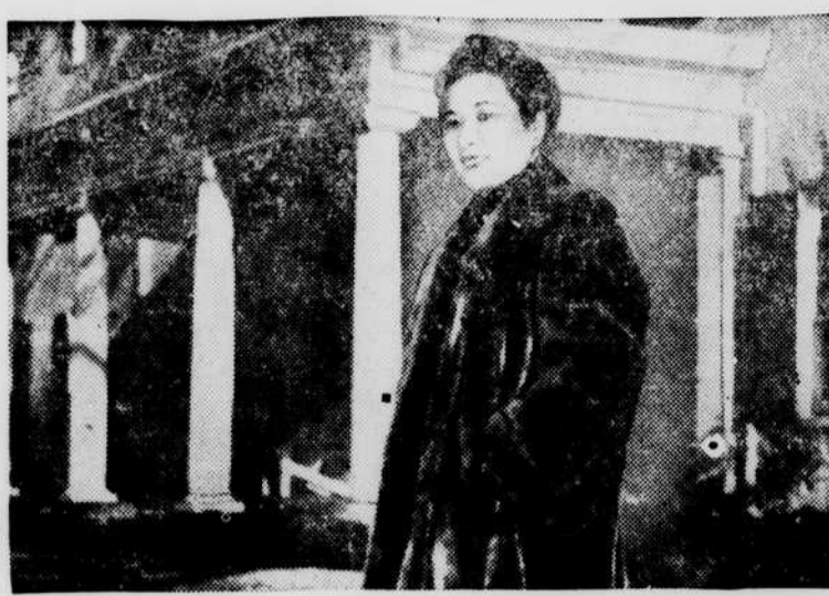
MADAME CHIANG . . . Photo shows Madame Chiang Kai-shek, wife of Generalissimo Chiang Kai-shek, of China, standing on the lawn in front of the home of Secretary of State and Mrs. George C. Marshall near Leesburgh, Va. Madame Chiang Kai-shek was invited to stay at the Marshall home as soon as it was announced that she was coming to the United States.

According to the reports, any Eastern government set up in the Soviet occupation zone would sign a formal peace treaty with Russia. The possible time mentioned for such signing was next Spring.