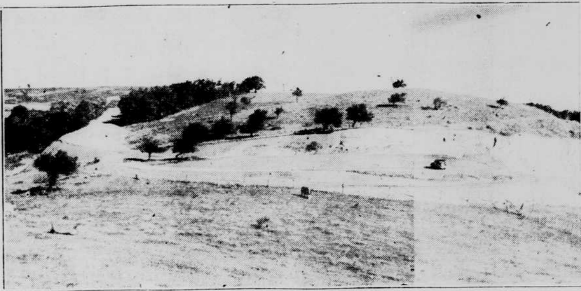
Thousands of tourists are expected in this section when the Parkway areas officially open for the season on Friday. Fishermen are also expected to be actively engaged in their favorite sport.