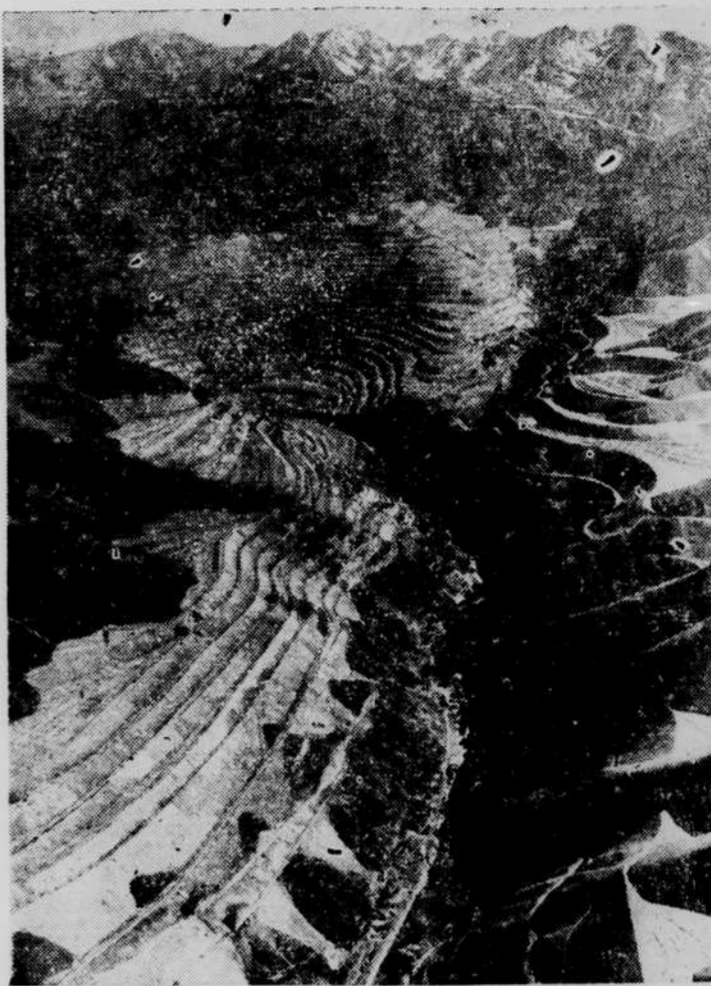
MAN-MADE WONDER—This, the largest open-cut copper mine in North America, is the major mining operation of Utah. The Utah Copper Division mine of Kennecott Copper corporation at Bingham Canyon, Utah, provides about 30 percent of America's newly mined copper in normal times. The excavation covers approximately 855 acres, from which a total of 1,173,321,423 tons of both waste and ore have been removed. Kennecott operations constitute a substantial factor toward Utah's prosperity.

We also had the privilege on Sunday afternoon to go to Kennecott Copper Mine, the largest open-cut copper mine in North America, which produces about 3 per cent of our copper. Operation began in 1904 and except with just a few interruptions it