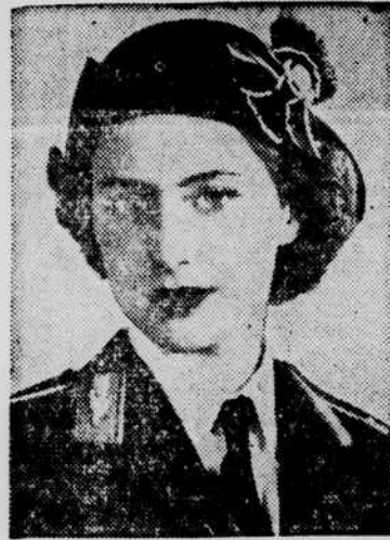
Princess Margaret in uniform. A new portrait of the youngest daughter of England's king and queen, shown in the uniform of the St. John Ambulance Brigade.