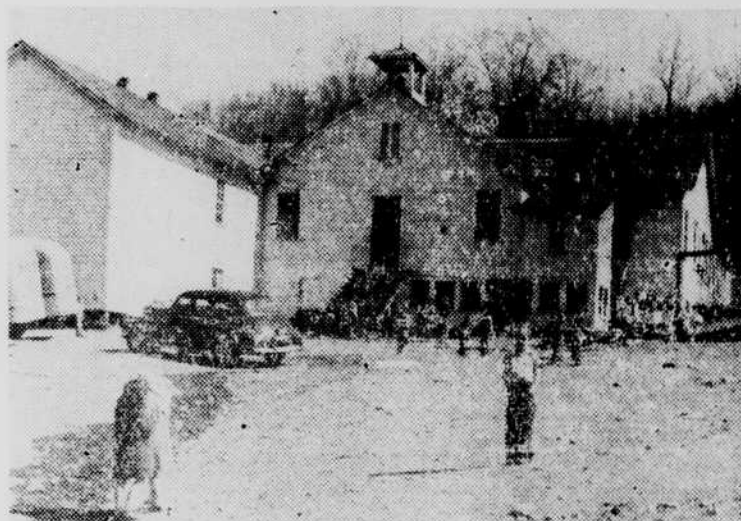
Two of Ashe county's wooden school buildings that need replacing are Fleetwood, left and Elkland, right in addition to being inadequate these two buildings were among those ruled unsafe by the grand jury in a recent inspection.

teacher unit, the school to be located near Sugar Grove.