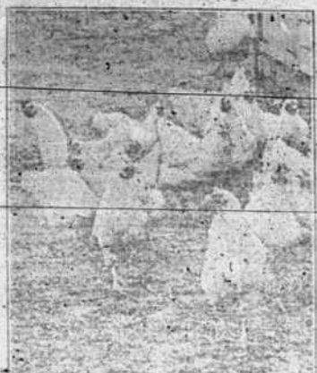
Don't Keep a Rooster—Hens Lay Better Without the Presence of a Male Bird.

Various snappy and pungent condiments are used for the purpose, but the following mixture has been found as good as any and may be made up by the flock owner at low cost: Mix equal parts of ground red pepper, ground allspice, ground ginger and ground cloves, and one-half part of ground fennel seed. Many of the condiments sold to flock owners are largely filler and sell for a high price. In the mixture given there is nothing but the essentials. A tablespoonful of the mixture in 2 quarts of moist mash 2 or 3 times a week or a teaspoonful in 1 quart daily should be