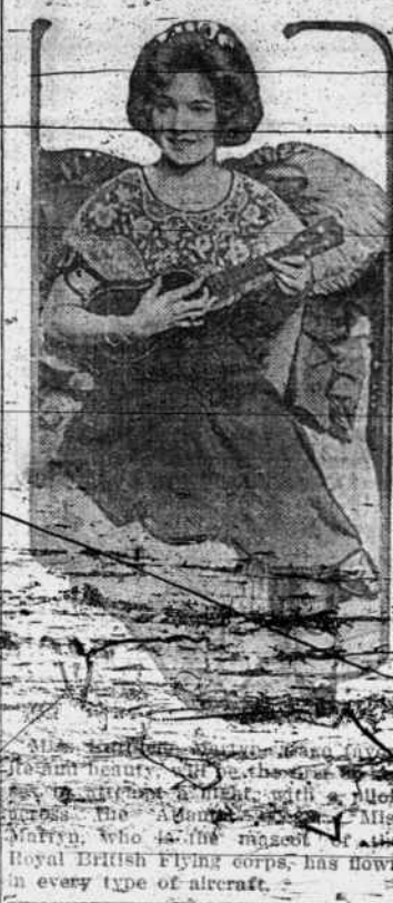
Miss ... who is the mascot of the Royal British Flying corps, has flown in every type of aircraft.