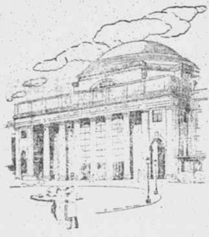
If you arrive in Richmond at Broad Street Station, pause a moment to enjoy the beauty of that Georgian structure. It is an imposing and monumental building of limestone and marble. Miller & Rhoads Store is only ten minutes' car ride from there.