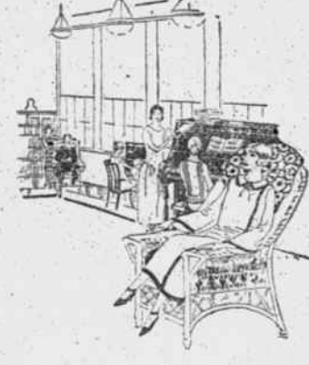
We do not believe that a tired, overworked salesperson can give you the attention you deserve. We have, therefore, provided an employees' roof garden, with rest rooms, and a hospital room in charge of a trained nurse and maid. Here the employee may relax and rest. Lunch is served to employees at cost.