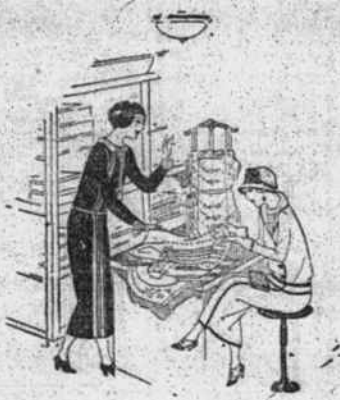
You can depend upon a Miller & Rhoads salesperson for sound judgment and good taste. In the selection of merchandise their intelligent guidance is a valuable help to the shopper.

A SHOPPER came to us one day fairly bubbling over with enthusiasm. It was her first visit to Miller & Rhoads Store.