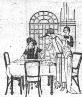
Delicious food, nicely cooked, is served at reasonable prices in our tea-rooms on the fifth floor. Take the express elevator directly to the tea-rooms.