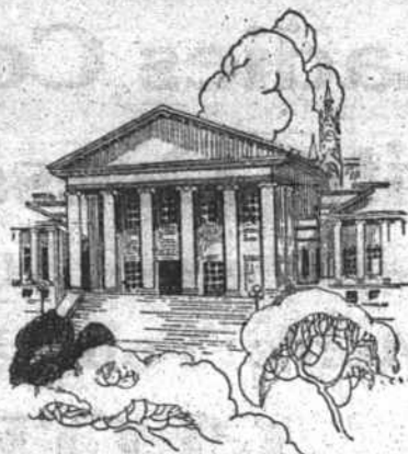
The State House—designed by Thomas Jefferson and later used as the Capitol of the Confederacy. It is one of the interesting sights of Richmond, within a short distance of Miller & Rhoads Store.

OF ALL the days in the year, Easter, with its lovely traditions, its joy and its optimism, is the time to visit Richmond. The streets of this interesting old capital are radiant with the color of spring styles. Grace Street, the "Fifth Avenue" of Richmond, is the brilliant scene of a fashion parade reminiscent of the old South. It is a sight worthy of a trip to this delightful city.