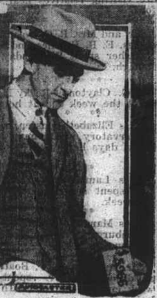
Bucky Harris, youthful manager of the World Champion Senators, ends not admit it but he got one of his biggest thrills when he angled this check, his part of the players' World Series share.

all crops grown on the farm will benefit from an application of lime to the soil; but legumes, especially, are benefited and experiments show that these crops will take up for food purposes from three to four times as much lime as will the cereals. It has been found in Ohio that a normal yield of alfalfa will contain 225 pounds of carbonate of lime to the acre.