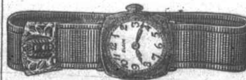
This beautiful new style watch and the $100 diamond ring was purchased at Newell's jewelry store, Roxboro, N. C.

This Nomination Blank will count for 10,000 votes for yourself or your favorite when properly filled out and sent in to the Manager of the Campaign. Only one of these Nomination Blanks will be credited to any one candidate.