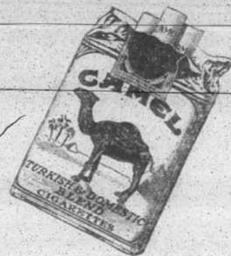
© 1927, R. J. Reynolds Tobacco Company, Winston-Salem, N. C.

The Camel blend of choice tobaccos makes a smooth, cool, mild, refreshing smoke. No special treatment for throats—Camel tobaccos don't need it.