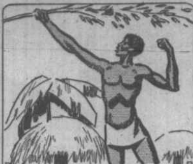
RAIN DOCTORS OF THE ZULU TRIBES HELD A BRANCH OF SOME TREE IN HIS HAND AND WHISTLED INTO THE SKY BELIEVING THIS WOULD FRIGHTEEN AWAY THE LIGHTNING.