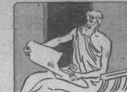
500 YEARS BEFORE THE BIRTH OF CHRIST, GREEK DOCTORS BEGAN TO TEACH THE BENEFITS OF DIET, EXERCISE AND CARE OF THE BODY.