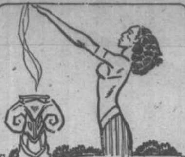
IN ANCIENT MEXICO IT WAS CUSTOMARY TO GIVE FESTIVALS IN HONOR OF THE GODDESS OF MAIZE. OF SOME TREE IN HIS HAND AND WHISTLED INTO THE DANCES BEING A SUBTLE PLEA FOR A COP OF MAIZE TO GROW AS PROFUSELY AS WOMEN'S HAIR