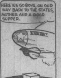
HERE WE GO BOYS, ON OUR WAY BACK TO THE STATES, MOTHER AND A GOOD SUPPER.