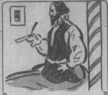
BADBERS AT ONE TIME PERFORMED MINOR OPERATIONS IN SURGERY (WHEN BLEEDING WAS A CURE FOR MOST ILLS). PATIENTS HELD ONTO A POLE. RED & WHITE STRIPES INDICATE BANDAGES