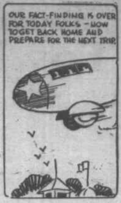
OUR FACT-FINDING IS OVER FOR TODAY FOLKS - NOW TOGETHER BACK HOME AND PREPARE FOR THE NEXT TRIP.