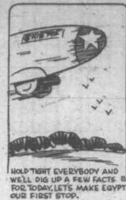
HOLD TIGHT EVERYBODY AND WELL DIG UP A FEW FACTS FOR TODAY. LETS MAKE EGYPT OUR FIRST STOP.