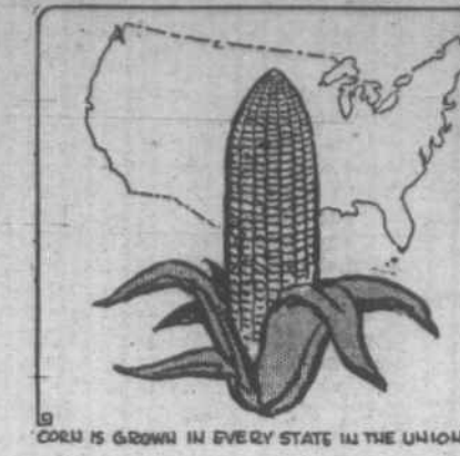
CORN IS GROWN IN EVERY STATE IN THE UNION.