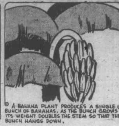
A BANANA PLANT PRODUCES A SINGLE BUNCH OF BANANAS. AS THE BUNCH GROWS ITS WEIGHT DOUBLES THE STEM SO THAT THE BUNCH HANGS DOWN.