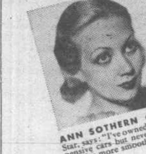
ANN SOTHERN Columbia Star says: "I've owned many expensive cars but never one that handles more smoothly than my Ford V-8."

HOLLYWOOD has gone "V-8." In America's colorful moving picture capital the Ford V-8 is easily the most popular car.