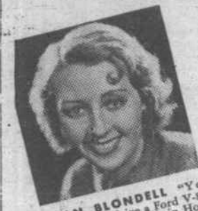
JOAN BLONDELL "You simply must drive a Ford V-8 if you want to be smart in Hollywood today."