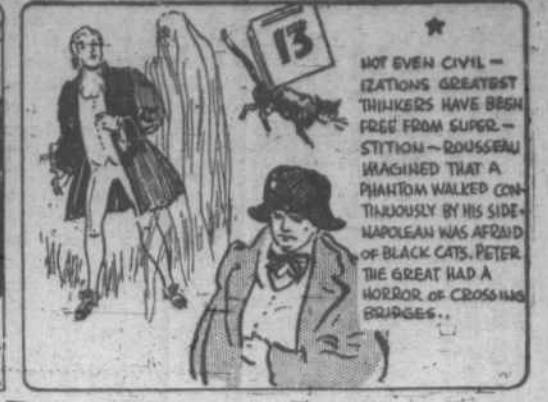
NOT EVEN CIVIL - (ZATIONS GREAT) THINKERS HAVE BEEN FREE FROM SUPERSTITION - ROUSSEAU IMAGINED THAT A PHANTOM WALKED CONTINUOUSLY BY HIS SIDE - NAPOLEON WAS AFRAID OF BLACK CATS, PETER THE GREAT HAD A HORROR OF CROSSING BRIDGES....

West 22.26 chains to a stake, Hargiss line; thence with Hargiss line North 28 1/2 deg. East 10.50 chains to the Allensville-Roxboro Road; thence with this road North 82 deg. East 3 chains; North 89 deg. East 5.69 chains; North 45 deg. East 11 chains; North 55 deg. East 5.50 chains; North 71 deg. East 8 chains; North 79 deg. East 6 chains; North 85 deg. East 10 chains; North 43 deg. East 15.65 chains to the BEGINNING, containing 110.4 acres, more or less. Conveyed to Ed. T. Gentry by J. L. Garrett and wife by deed recorded in Book 27, Page 338.