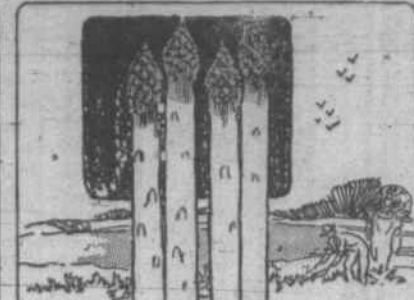
ASPARAGUS BEDS WILL PRODUCE FOR A HUNDRED YEARS. IN SOME COUNTRIES ASPARAGUS SEEDS ARE USED FOR COFFEE....