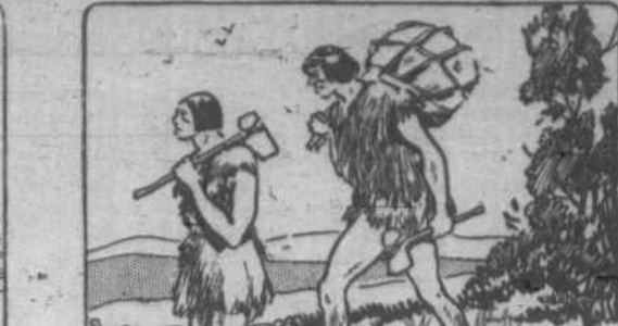
THE MEN OF THE STONE AGE, IN CENTRAL EUROPE, OFTEN HAD AXES MADE OF JADE WHICH HAD BEEN BROUGHT ALL THE WAY FROM THE CENTER OF ASIA - BECAUSE THE JADE TOOK A BETTER EDGE THAN THE FLINTS AVAILABLE IN CENTRAL EUROPE....