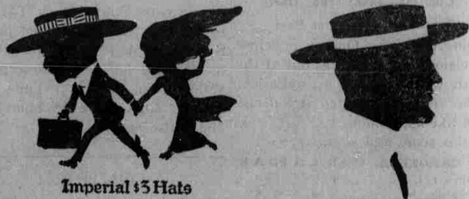
Imperial $3 Hats

Notion Novelties of all kinds. Invite the Student and Faculty trade to give us a trial. We are here to please YOU.