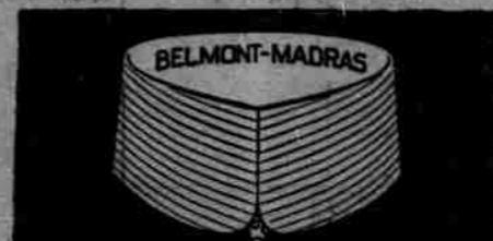
The popular "Belmont" notch Collar made in self striped Madras. 2 for 25c

"Spring Maid," TUESDAY NIGHT, JANUARY 14.