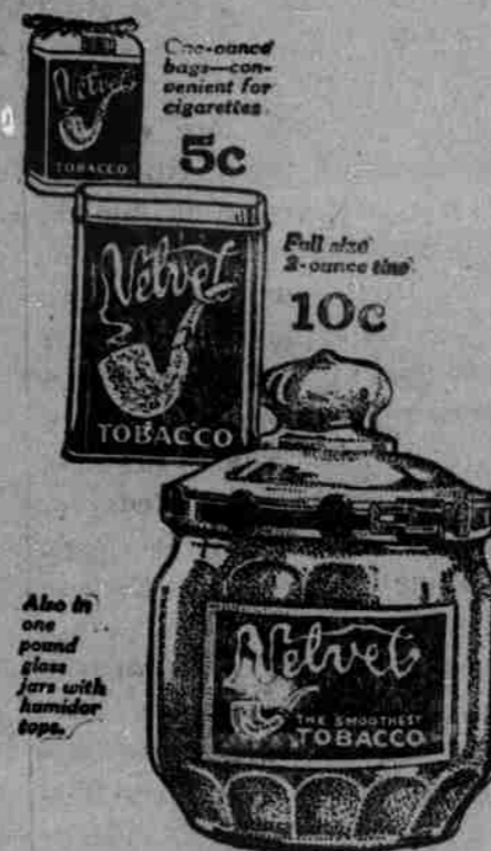
Also in one pound glass jars with humidifier tops.