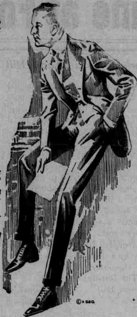
Society Brand Clothes

Recent arrivals of big shipments of Hart Schaffner & Marx and Society Brand Suits, enable us to offer an early showing of the new things for the coming season. Leave it to us to take care of your clothes needs. We will not disappoint you.