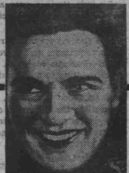
Charles (Buddy) Rogers