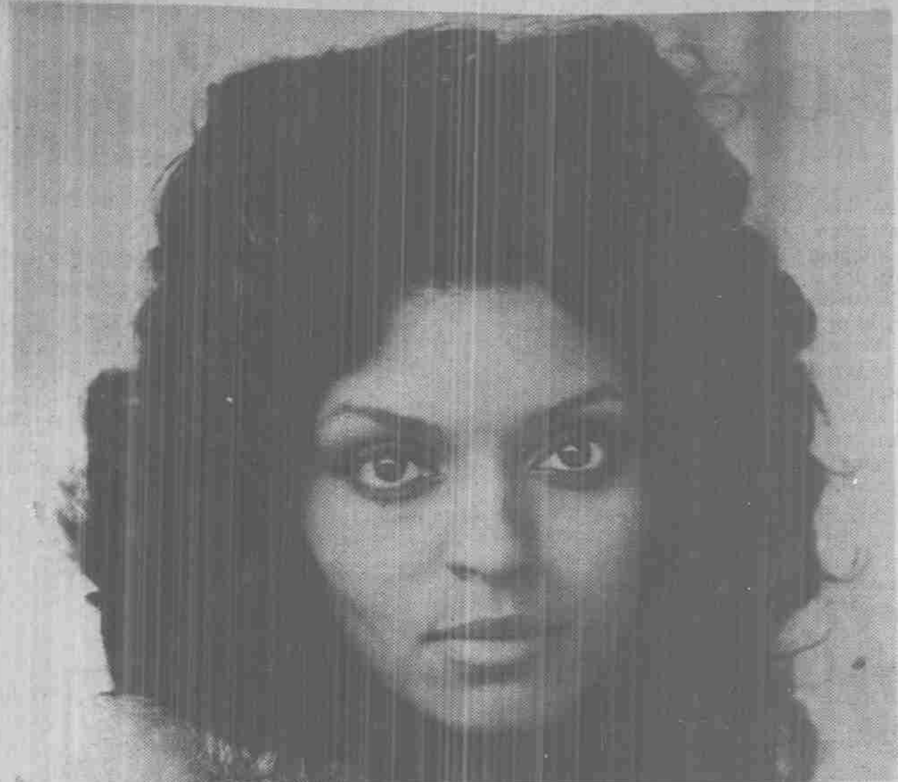
A music fan

So, you missed them at the Concert Hall. So did a lot of people. But you can pick up a copy of Scratch recorded live at the Roxy and hear them. And, listen. Do you hear that horn? Do you hear that note? That's not a note. That's two people playing. Two people playing as one.