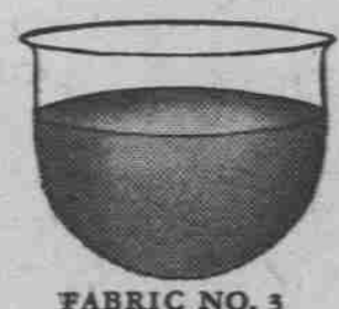
FABRIC NO. 3