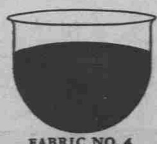
FABRIC NO. 4