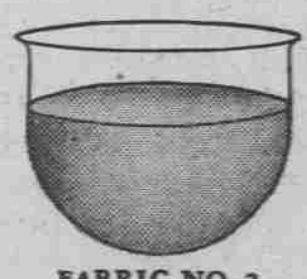
FABRIC NO. 2