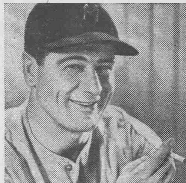
LOU GEHRIG has played in more than 1500 consecutive big league games. Such an athletic achievement takes "wind"—healthy nerves—"condition." Lou says: "For steady smoking I pick Camels. They're so mild they never get my 'wind' or my nerves."

(Signed) R. J. REYNOLDS TOBACCO COMPANY, Winston-Salem, N. C.