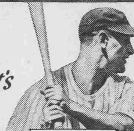
BASEBALL LOU GEHRIG "Iron Man" of baseball