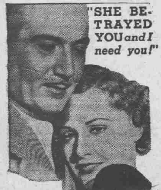
"SHE BETRAYED YOU and I need you!"

You'll Enjoy Getting Your Hair Cut at the UNIVERSITY BARBER SHOP We Appreciate Your Trade