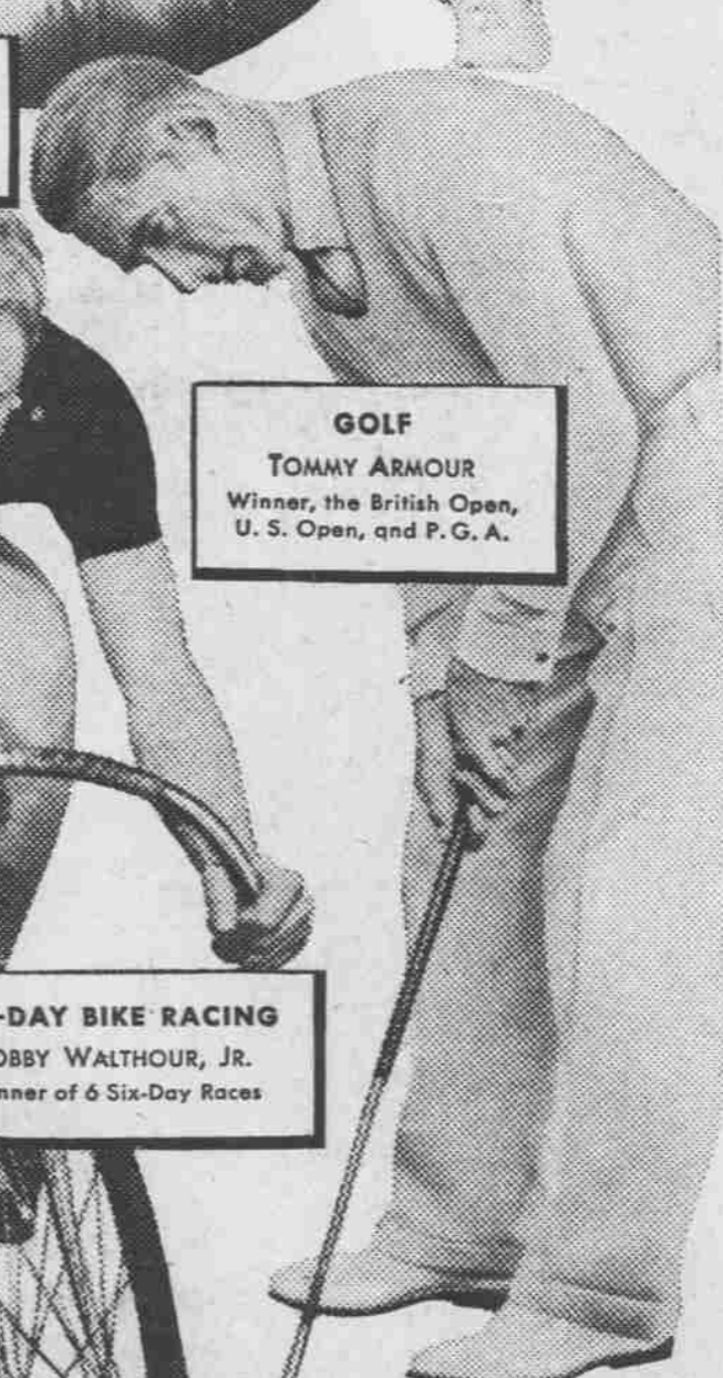
GOLF TOMMY ARMOUR Winner, the British Open, U. S. Open, and P. G. A.