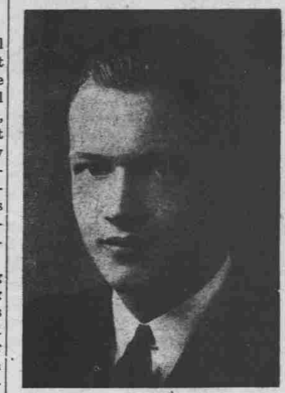
. appreciates nomination