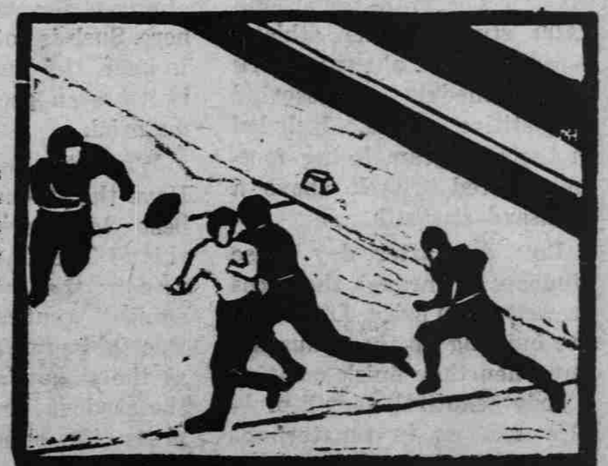
Shhhhh! This is a picture of the Yackety-Yack squad holding a secret practice. Shhhhh!