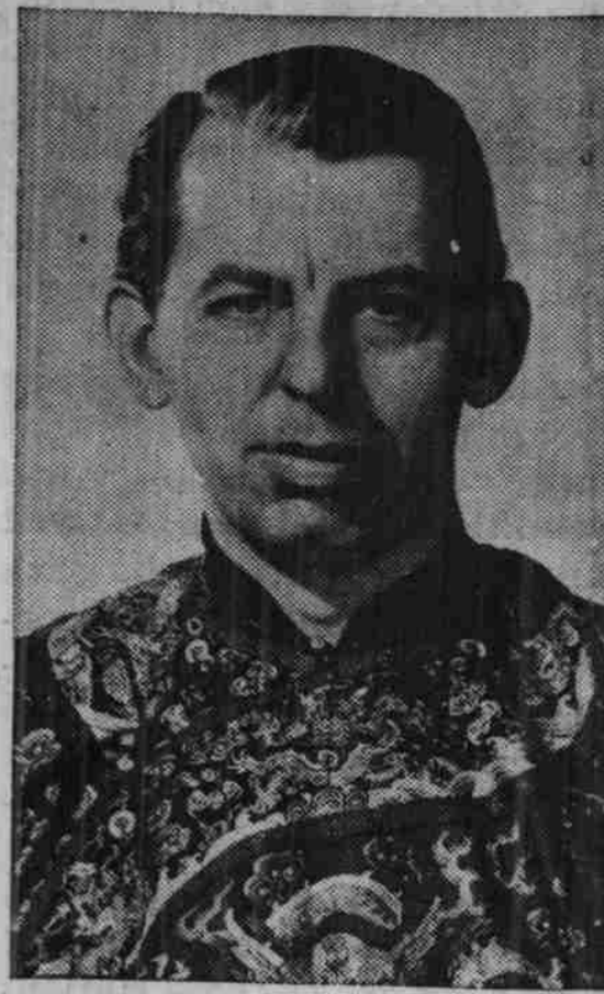
JOHN MULHOLLAND, world-famous magician who will appear in Memorial hall tonight at 8:30 as the final Student Entertainment series program for the Fall quarter.