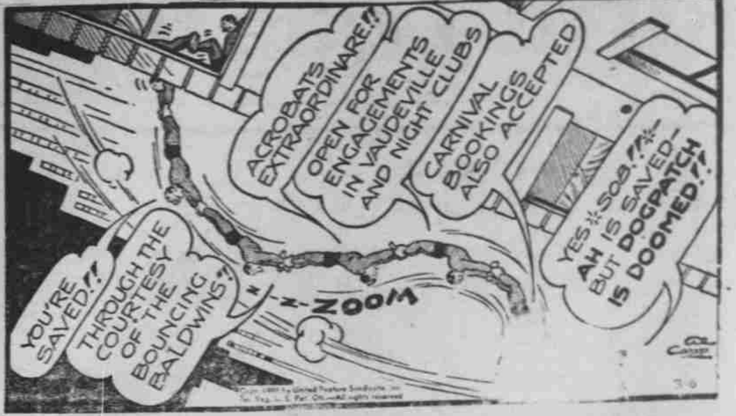
Close Them Pearly Gates