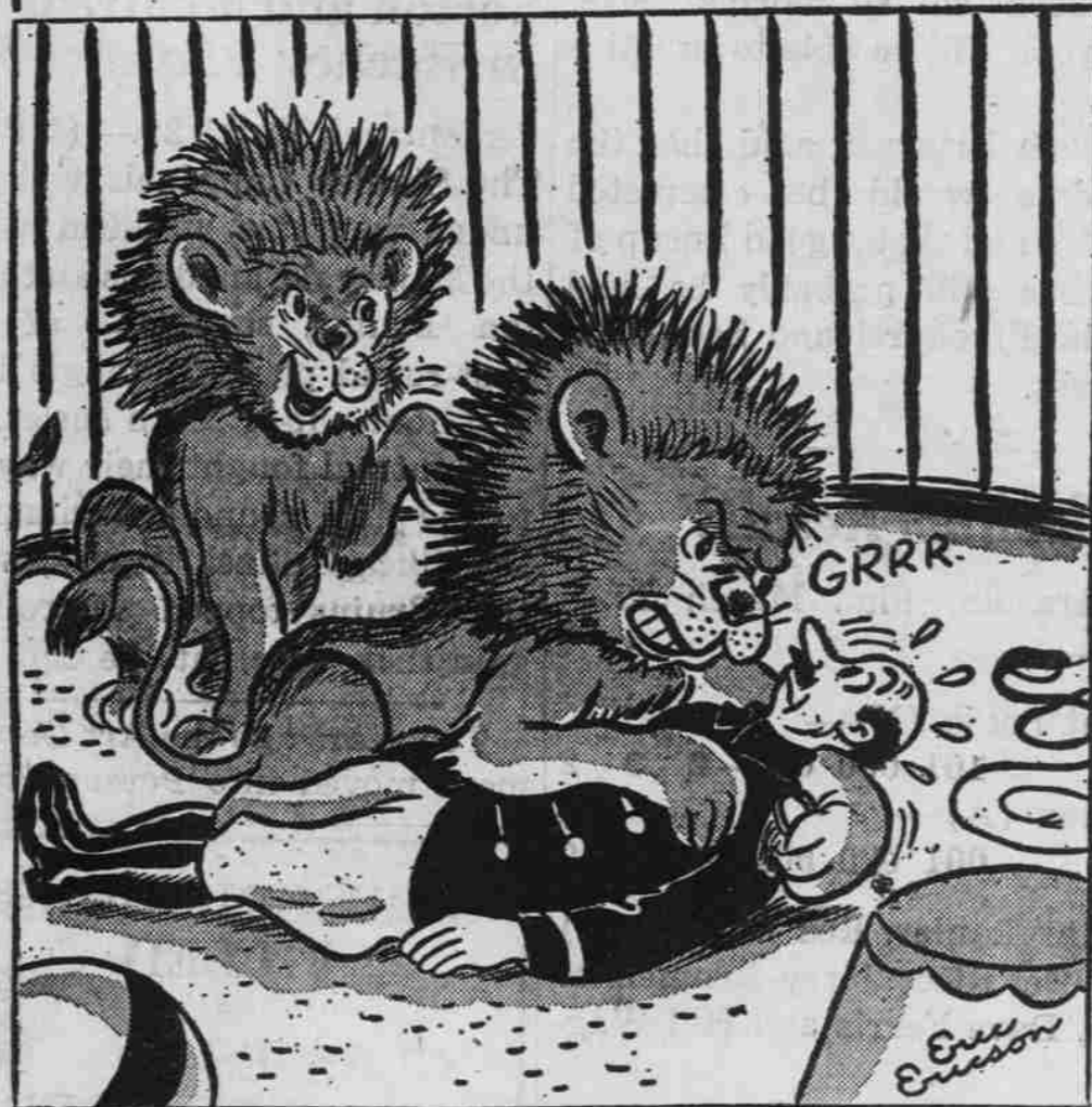
"Restrain yourself, Leo. He buys a War Bond every week."