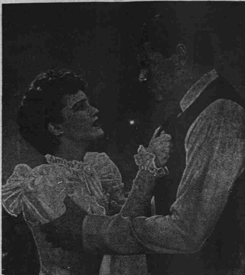
Romance reaches dramatic proportions in Paramount's Technicolor production, "The Virginian," which comes today to the Carolina Theatre, with Joel McCrea, Brian Donlevy and Sonny Tufts in the starring roles. Here lovely Barbara Britton pleads with McCrea, the Virginian, not to seek a showdown with Donlevy, who plays Trampas, the cattle-rustler.