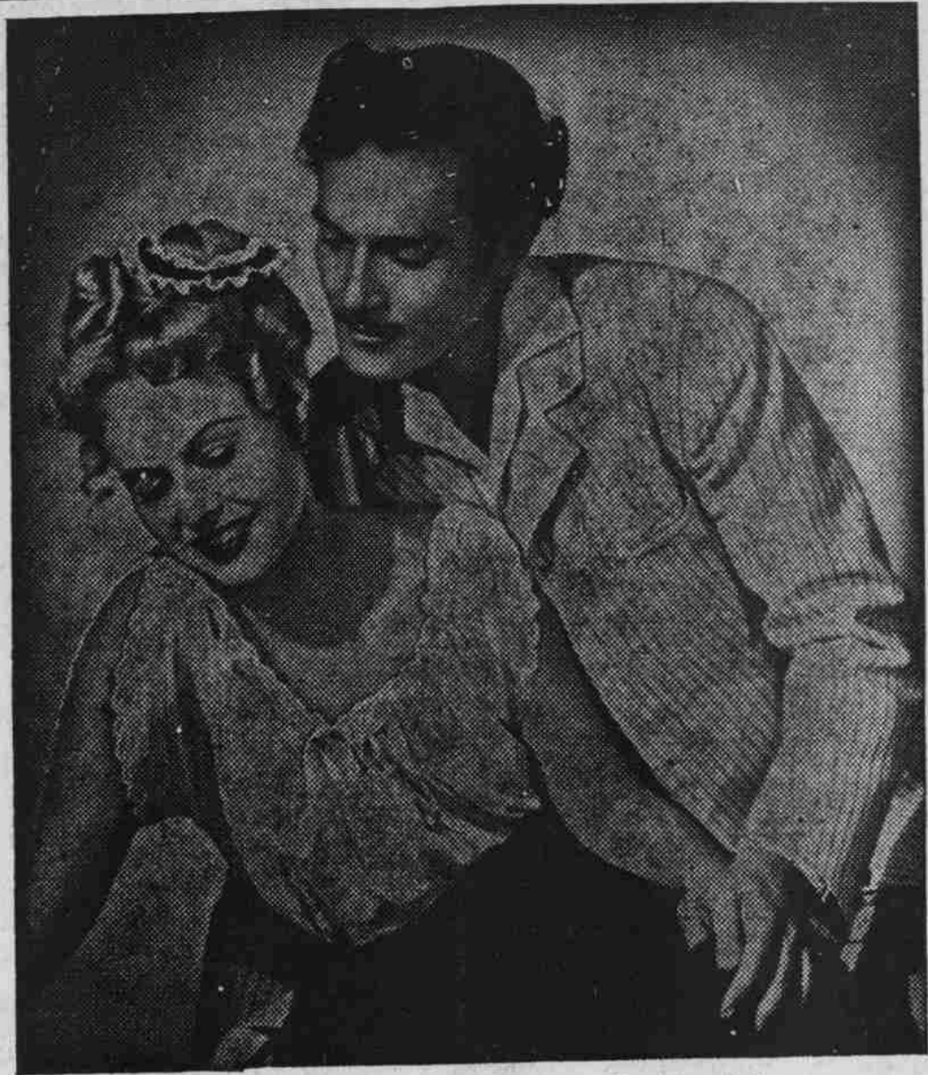
Above are Hurd Hatfield and Paulette Goddard in a romantic scene from "The Diary of a Chambermaid," showing at the Carolina today.