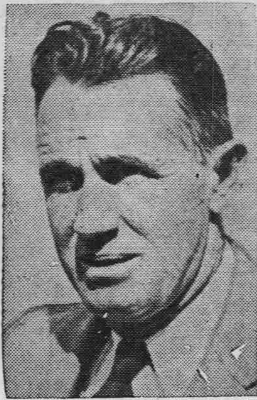
Carl Snavelly, above left, Carolina grid tutor, and Wallace Wade, Duke coach, resume their gridiron rivalry here Saturday afternoon for the first time since 1935. In their last meeting Wade beat Snavelly 5-0 to knock the Tar Heels out of a Rose Bowl bid.