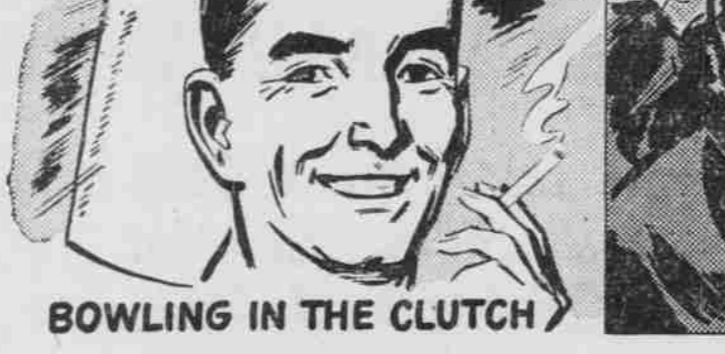
BOWLING IN THE CLUTCH