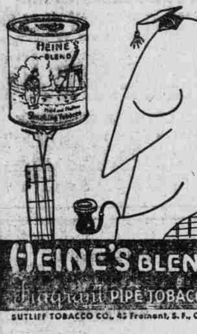
SUTLIFF TOBACCO CO., 42 Fremont, S. E., Calif.

Relax and Enjoy Your HEINE'S BLEND The Smoking Tobacco with an M. S. Degree* *Mighty Satisfying