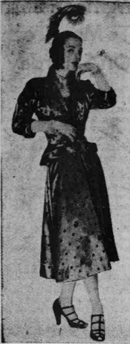
THE "COSMOPOLITAN Look" is shown in this shimmering satin dress suit. It's the current rave in New York, Boston, and Main Street. Top of the dress is black with short sleeves. You can choose from copper, turquoise or mauve pink for the background color, the dots remaining black. Cost—about $23.