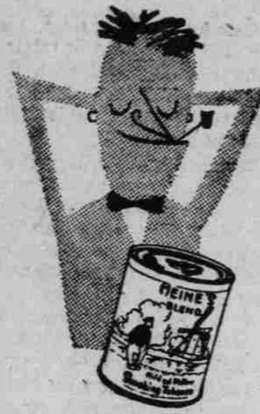
Men in "Who's Who" Attribute it to . . .

HEINE'S BLEND SUITABLE PIPE TOBACCO SULLIFF TOBACCO CO., 45 FRANKLIN ST., CHICAGO