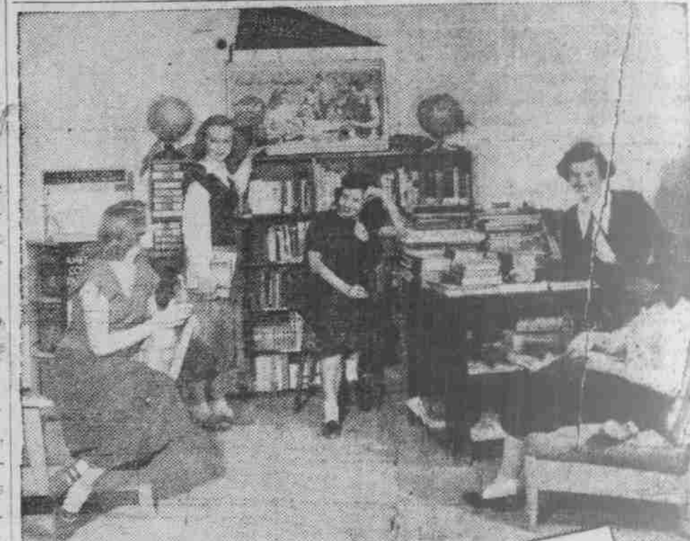
Book Store, Texas Technological College, Lubbock, Texas

Rent — Buy — Browse at the BULL'S HEAD BOOKSHOP U.N.C. Library Noel Coward: STAR QUALITY (Six Stories)