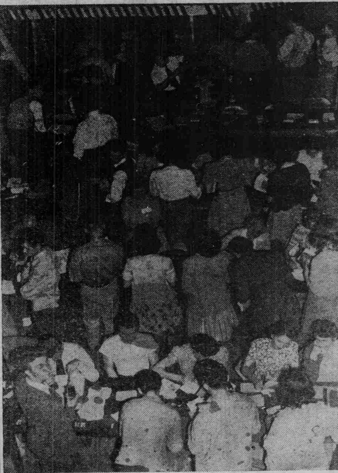
STILL CONFUSED? —Freshmen and new coeds attempt to find their way through the maze erected in Woollen Gymnasium for registration. Held Monday, Tuesday, and Wednesday, registration was no different from those of the past as remembered by upper classmen, although the administration reports it ran "more smoothly than usual." The same old story of confusion, cussing, a constant rumble, and lost souls underwent its annual reliving. But as one of the more cool-headed freshmen observed, "What the heck, it only happens once in a life-time, and a day can't last but so long."