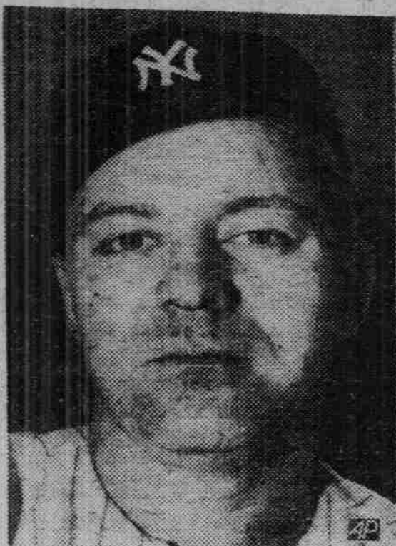
LEFTY ED LOPAT, who stopped the New York Giants on five hits was the star in the Yankees' 3-1 World Series win yesterday.

The Giants got their run in the seventh when Monte Irvin opened with a single and later scored on a long fly by Bill Rigney. After Irvin singled, Whitey Lockman sent him to second with a short single to center. Willy Mays forced Lockman at second and Irvin went to third, and from there pinch-hitter Rigney brought him home.