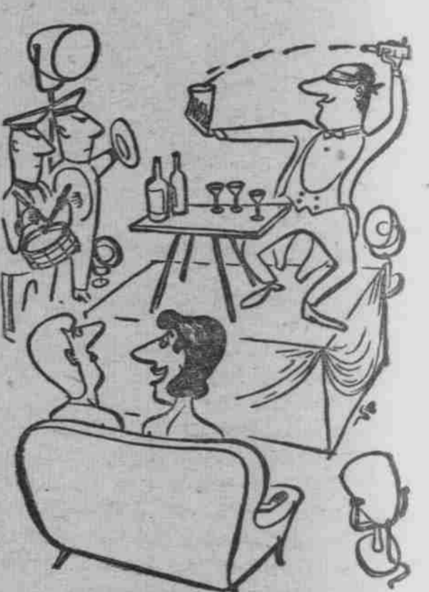
"He always makes such a production of putting in the Angostura*."