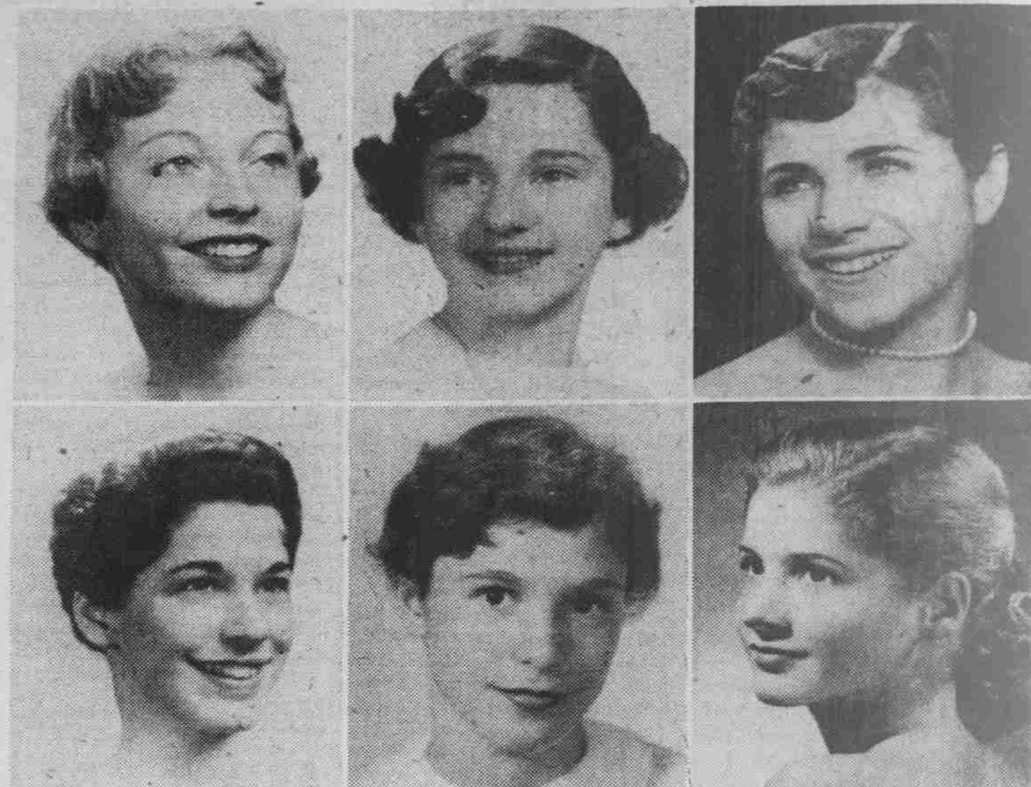
Zeta Beta Tau Pledges Have Weekend