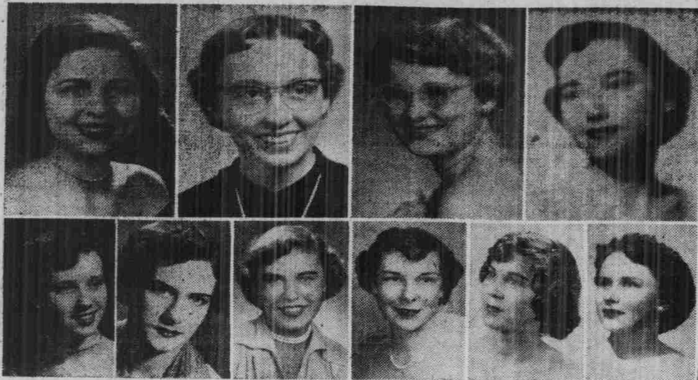
Sponsors For Theta Chi Jubilee