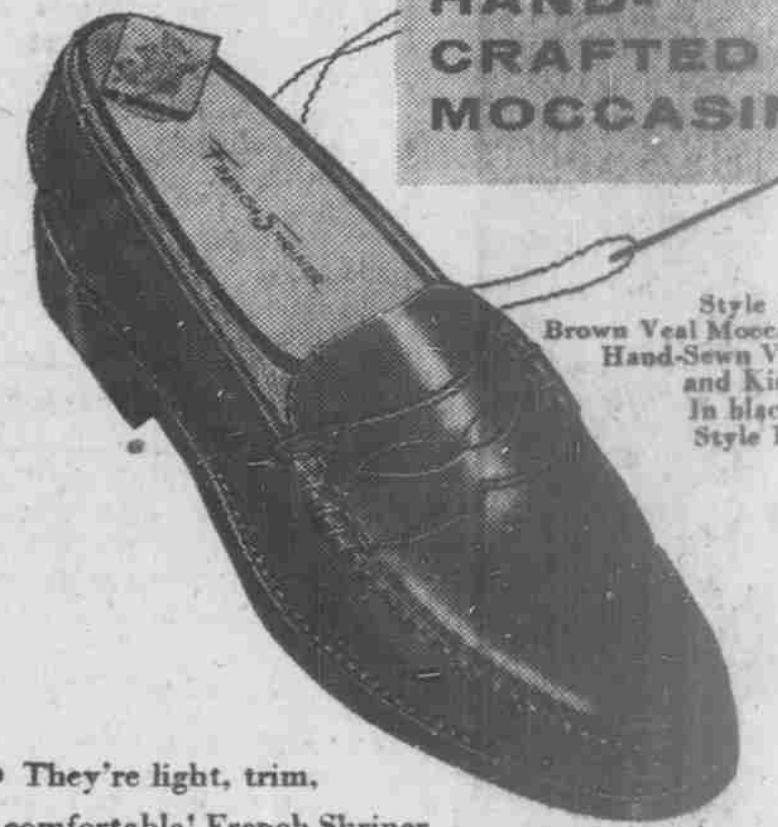
Style 1050 Brown Veal Moccasin, Hand-Sewn Vamp and Kicker. In black—Style 1060.

• They're light, trim, comfortable! French Shriners builds them with painstaking care, even to hand-sewing. Come in and enjoy their comfort today.