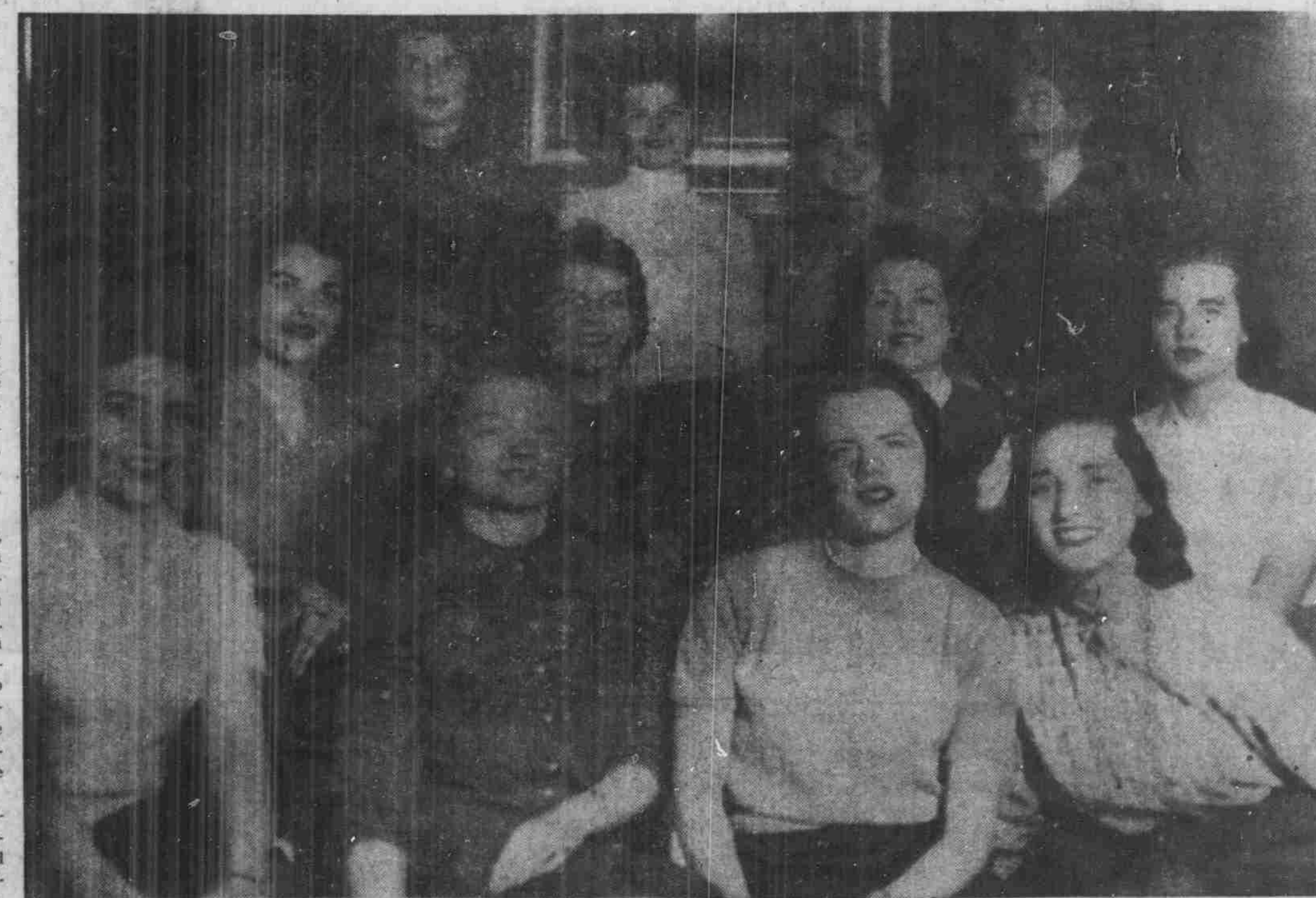
YWCA Slate Of Officer Candidates