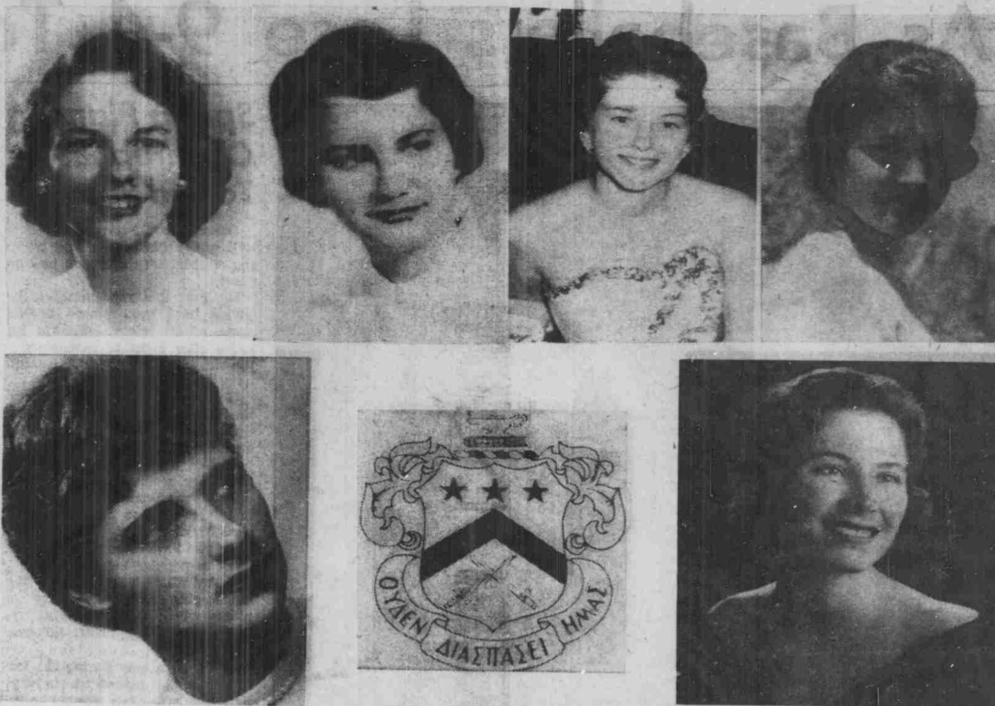
Pi Kappa Phi Rose Ball Sponsors