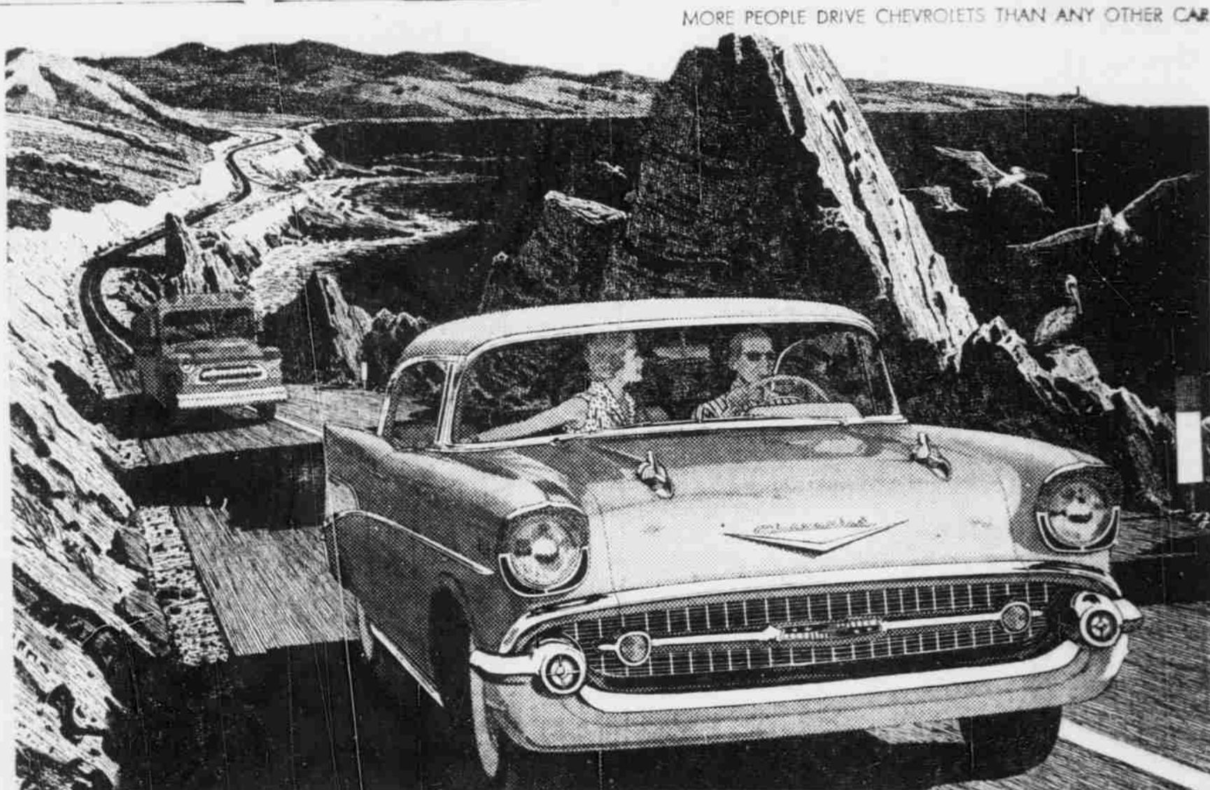
New Chevrolet Bel Air Sport Coupe with spunk to spare!