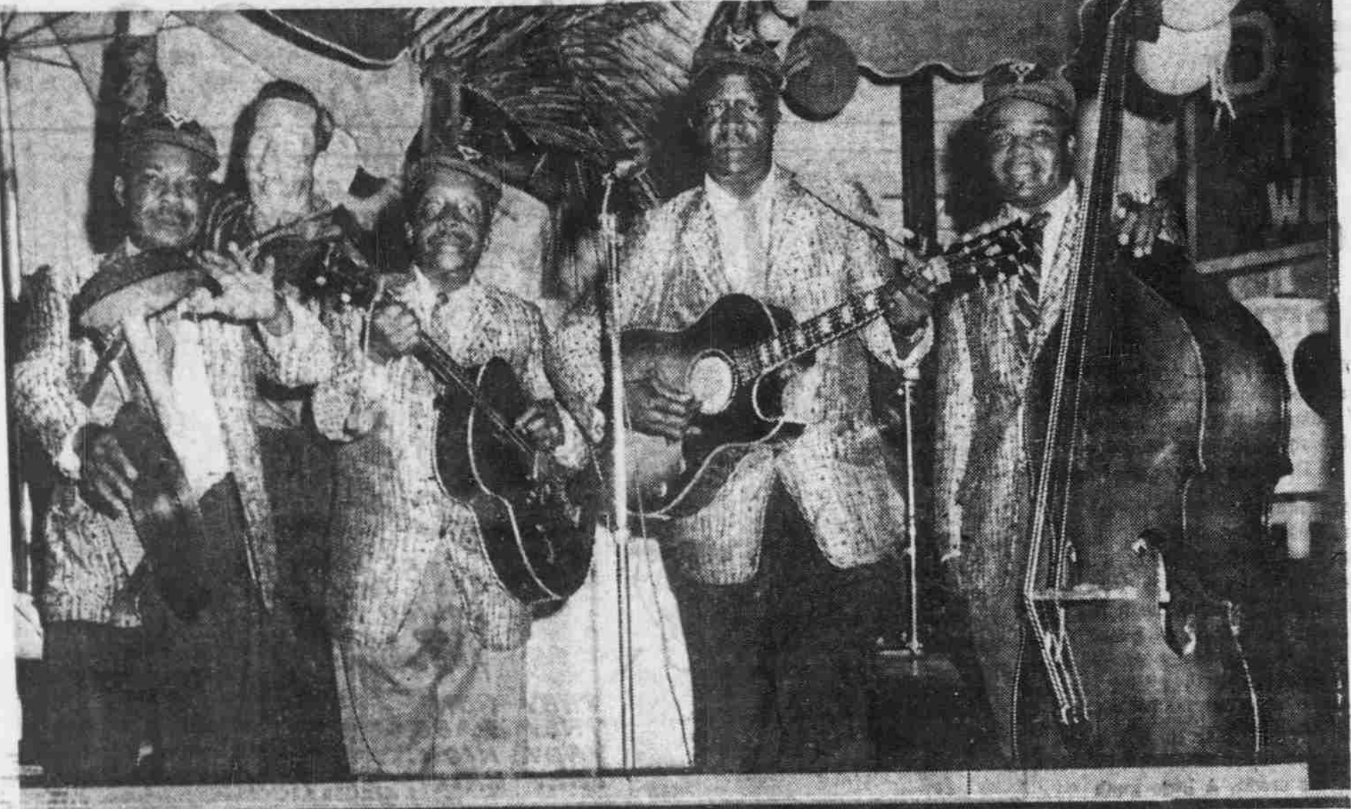
ADDED ATTRACTION FOR FALL GERMANS —Shown above are members of the Washboard Band, Negro combo from Sea, Island, Ga., where they are regular performers at the Oasis Club and the Cloister Hotel. The group has also entertained students at several southeastern colleges while on tour. They will perform here at Germans, which will be held this coming Friday.