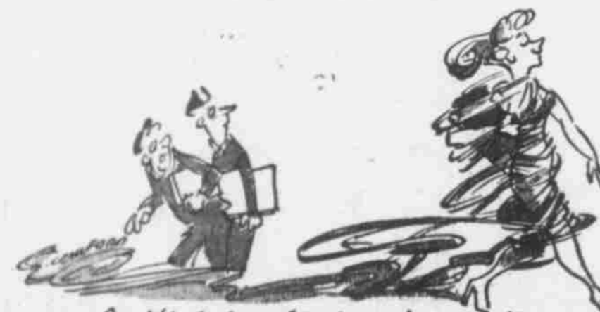
Camille hit on the ingenious notion of suiting her garb to the class she was attending. For instance, to English Lit she wore a buskin and jerkin. To German she wore lederhosen and carried a stein of pilsener. To Econ she wore 120 yards of ticker tape. Her shiningest hour came one day when she dressed as a white mouse for Psych Lab. Not only her Chi Omega sisters, but the entire student body went into deep mourning when she was killed by the janitor's cat.

Fourth, clothing. Never forget that your appearance reflects not just on yourself but on the whole house. It was well enough before you joined a sorority to lounge around campus in your old middy blouse and gym bloomers, but now you must take great pains to dress in a manner which excites admiring comments from all who observe you. A few years ago, for example, there was a Chi Omega named Camille Ataturk at the University of Iowa who brought gobs of glory to all her sorors.