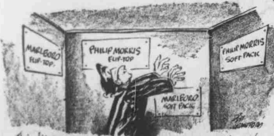
This little game has been a great source of merriment...

Speaking for myself, I smoke both Marlboro and Philip Morris in both packs. What I do is make kind of a fun thing out of it. In my bedroom I have four signs, one on each wall, which say in turn: "PHILIP MORRIS—SOFT PACK", "PHILIP MORRIS—FLIP-TOP", "MARLBORO—SOFT PACK" and "MARLBORO—FLIP-TOP". When I get up in the morning I put on a blindfold and then, my faithful cat Rover spins me around six times and then, with many a laugh and cheer, I walk forward with my finger outstretched and the first sign I touch is the cigarette I smoke that day!