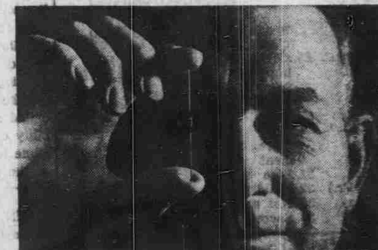
Capacitors which provide for electrical, rather than mechanical tuning of circuits, are being produced by Hughes Products, the commercial activity of Hughes.