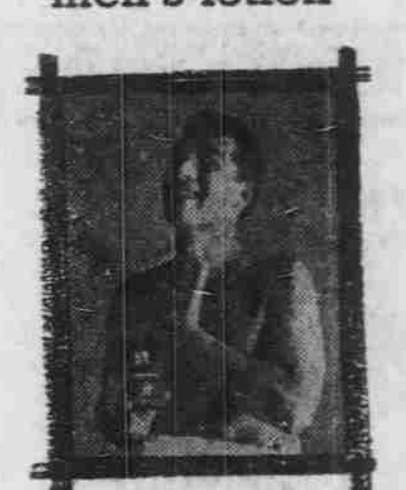
after shave after shower after hours