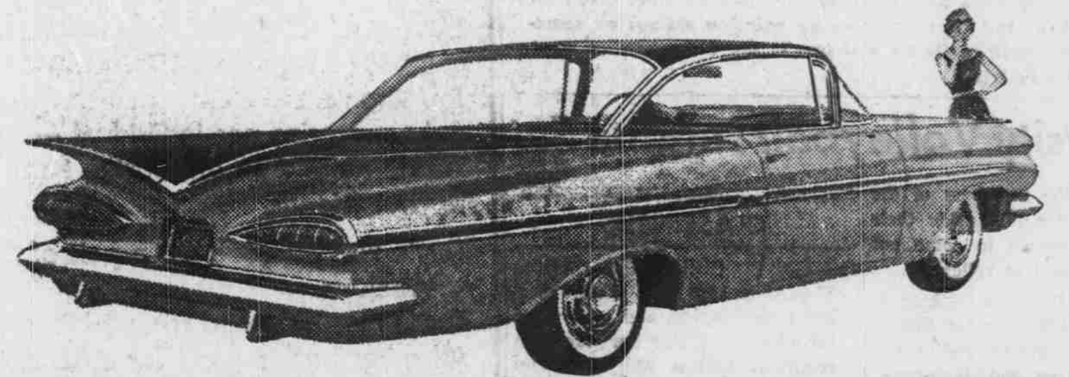
Like all '59 Chevrolets, this Impala Sport Coupe is now right down to the tougher Tyrez cord tires it rolls on.